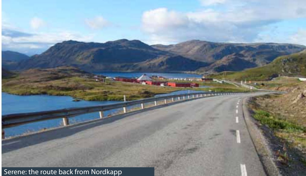
Serene: the route back from Nordkapp

end of January and April 2013, with bookings available for groups in late autumn, too. Riders must be confident riding off-road, but the route can vary depending on experience