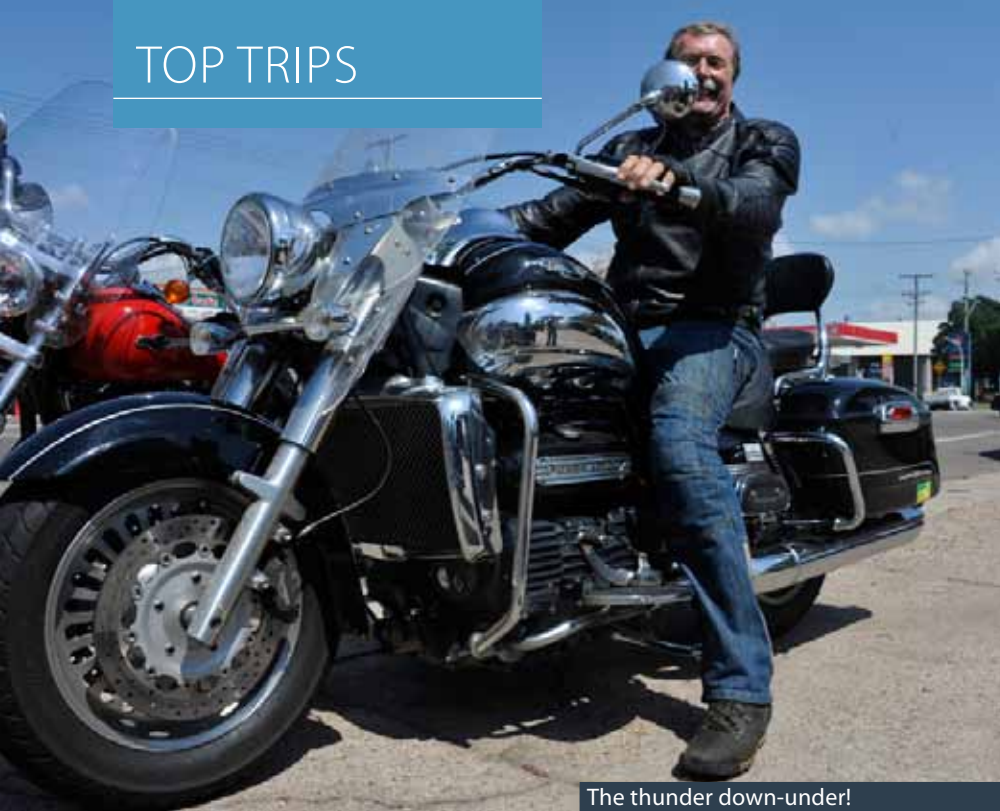
The thunder down-under!

itinerary and booking information can be found on the company's website.