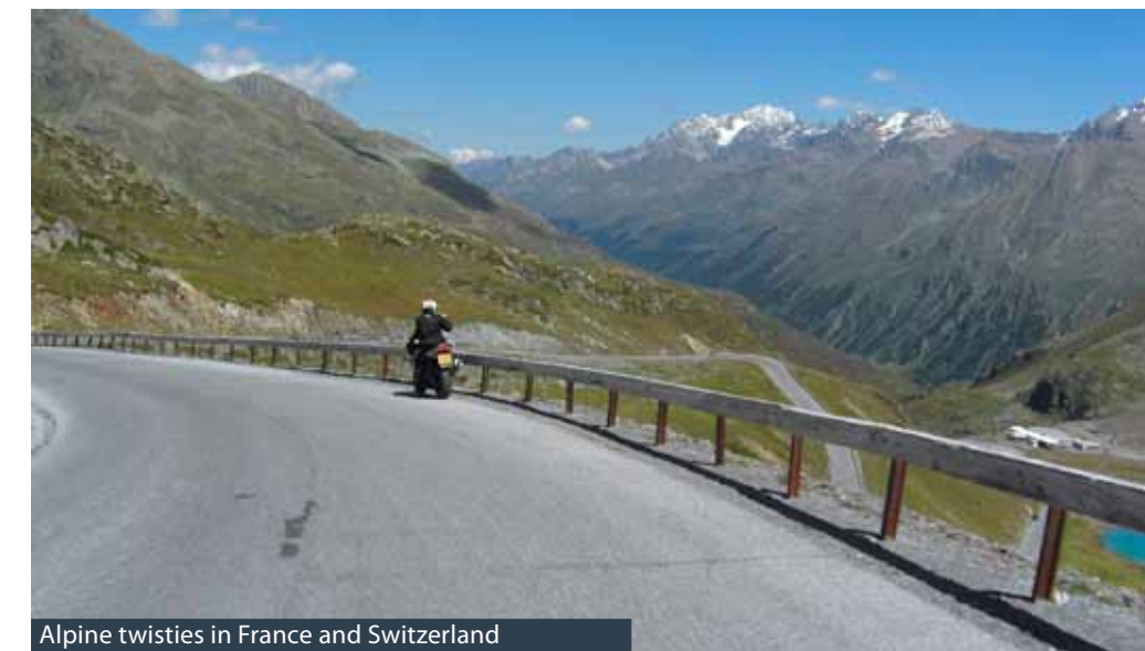
Alpine twisties in France and Switzerland

■ MORE INFO: The 12-day tour begins and ends in Folkstone, Kent; riders take the Euro tunnel onto the continent before embarking on the 2,520-mile journey. This tour is most suited to experienced riders who are used to covering distances over mountainous terrain