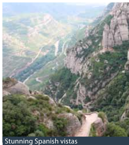
Stunning Spanish vistas

■ WHAT? For the city-hopping Euro-tour enthusiast, Moto Adventours offers an enthralling motorcycle escapade from southern Spain to the heart of the Czech Republic. The tour takes in the renowned cities of Barcelona, Florence and Innsbruck, among others, and takes riders to paradise on the islands of Sardinia and Corsica. Key sites along the way include the leaning tower of Pisa, Neuschwanstein Castle, and an essential stop at Munich, the beer capital of Bavaria. A trip like this wouldn't be complete without sampling the local delicacies in five different countries! The riding offers just as much variety with scenic, quiet roads and twisting, alpine switchbacks.