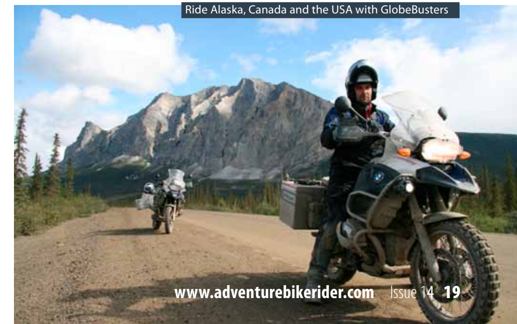
Ride Alaska, Canada and the USA with GlobeBusters

will spend the first week exploring Alaska, taking on the remote and infamous Dalton Highway, a grueling 450-mile dirt road trip with unpredictable weather conditions, to reach the Arctic Circle, where those feeling brave enough can take a dip in the icy waters of the Arctic Ocean. The second and third weeks entail a journey through Canada and the Yukon, passing through Jasper National Park among rocky peaks and thick forest, where riders are virtually guaranteed to spot bears and moose en route. Weeks five and six are through cowboy territory