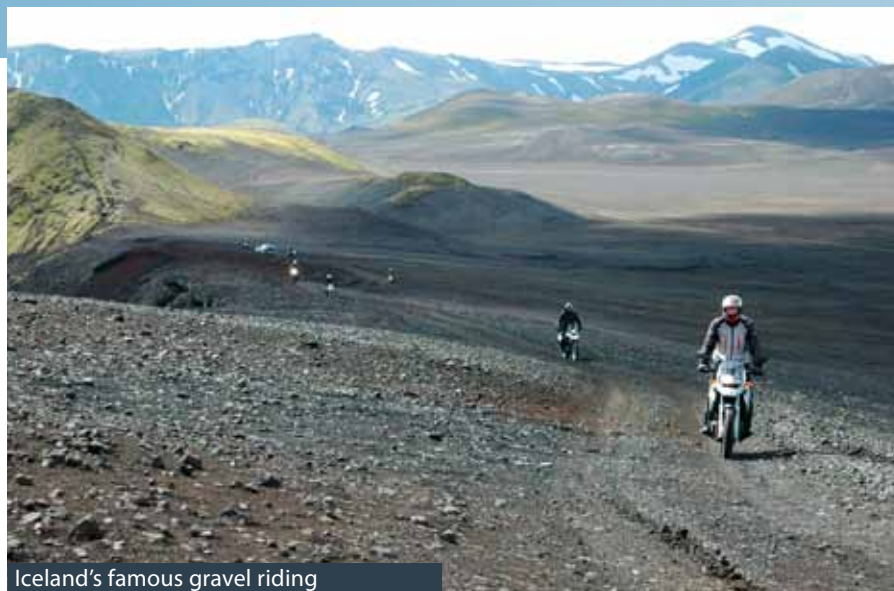
Iceland's famous gravel riding