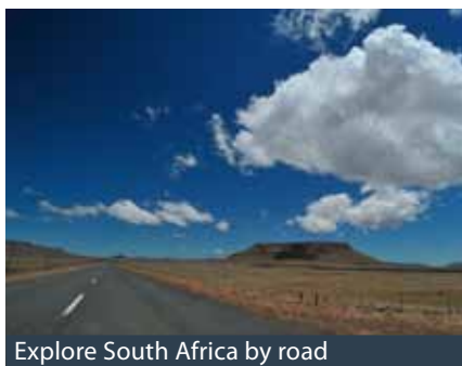
Explore South Africa by road