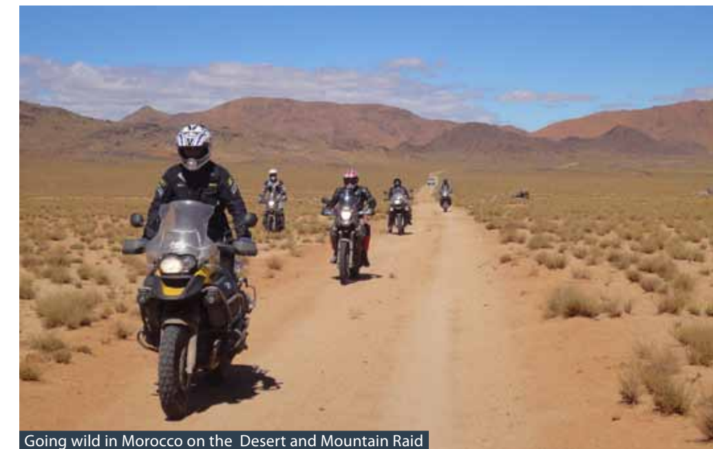
Going wild in Morocco on the Desert and Mountain Raid

MORE INFO: The tour is scheduled to depart in October 2013; it takes 15 days to complete approximately 620 miles of riding, mostly on tarmac roads. BBT can cater for any level of rider from a complete novice to the most experienced, with plenty of staff on hand. The price includes the hire of Royal Enfield Bullet bikes and accommodation in four-star hotels. An