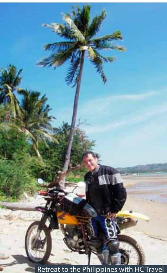
Retreat to the Philippines with HC Travel

■ MORE INFO: The tour covers around 800 miles of dirt roads and off-road trails in 15 days. The price includes rental of a Honda XLR 200 trail bike or similar, and accommodation in various hotels and quirky but comfortable residences. This tour is running over several dates between the